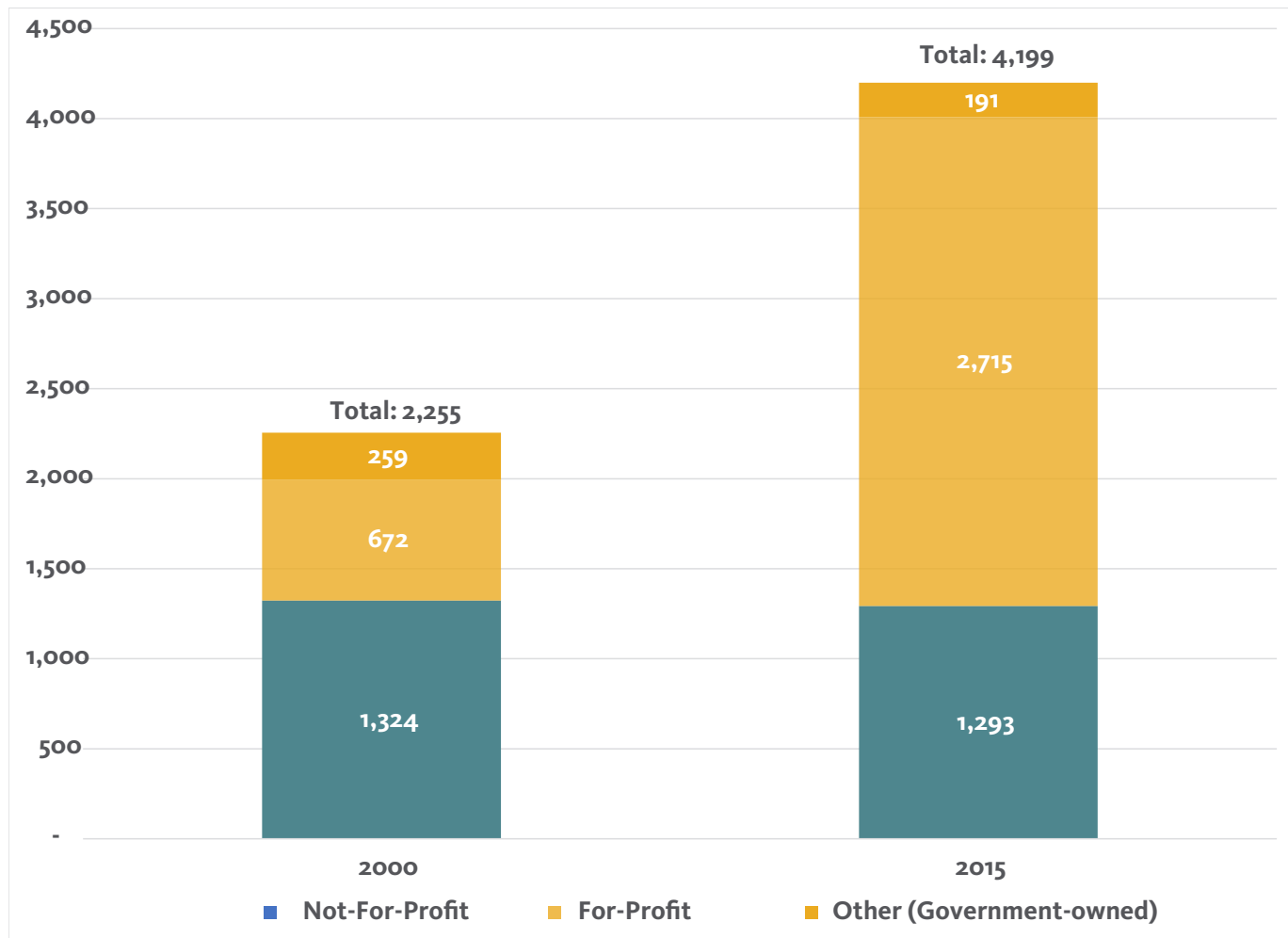
Figure 3. Growth in Number of Hospices by Ownership (Profit) Status from 2000 to 2015

Hospice is an attractive venture for private equity investors. Although mergers and acquisitions slowed during 2015-2017, they increased in 2017 along with overall growth in the industry. With increased consolidation trends and regulatory scrutiny, the number of not-for-profit providers is likely to decrease.